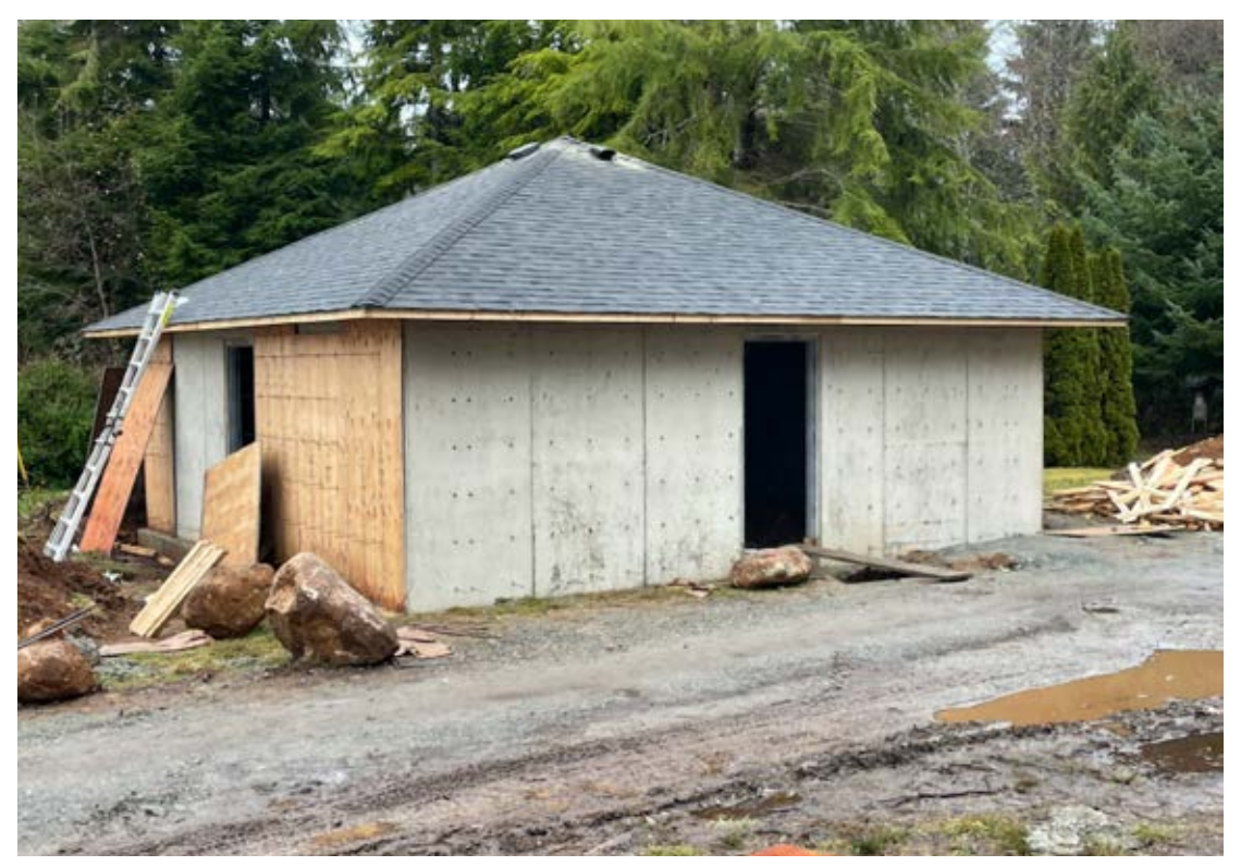
Construction of Alert Bay campground facility