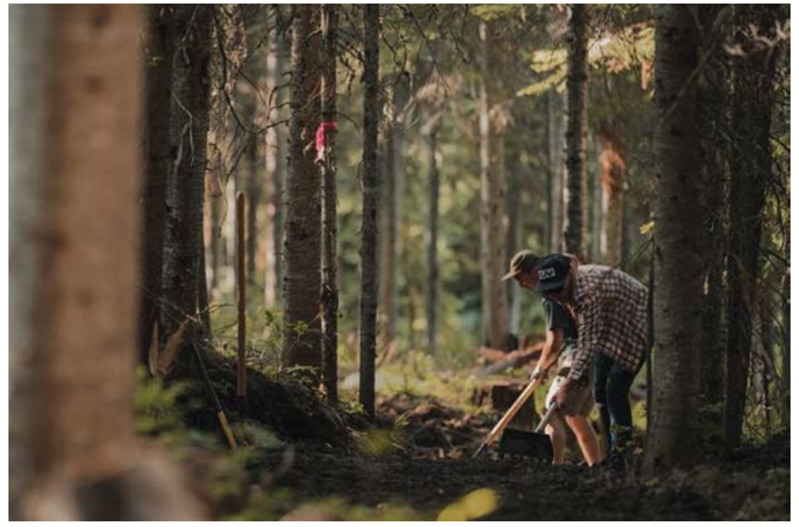
Work on Mt. Morrisey Destination Trail

See the response from the auditee on pages 23 and 24.