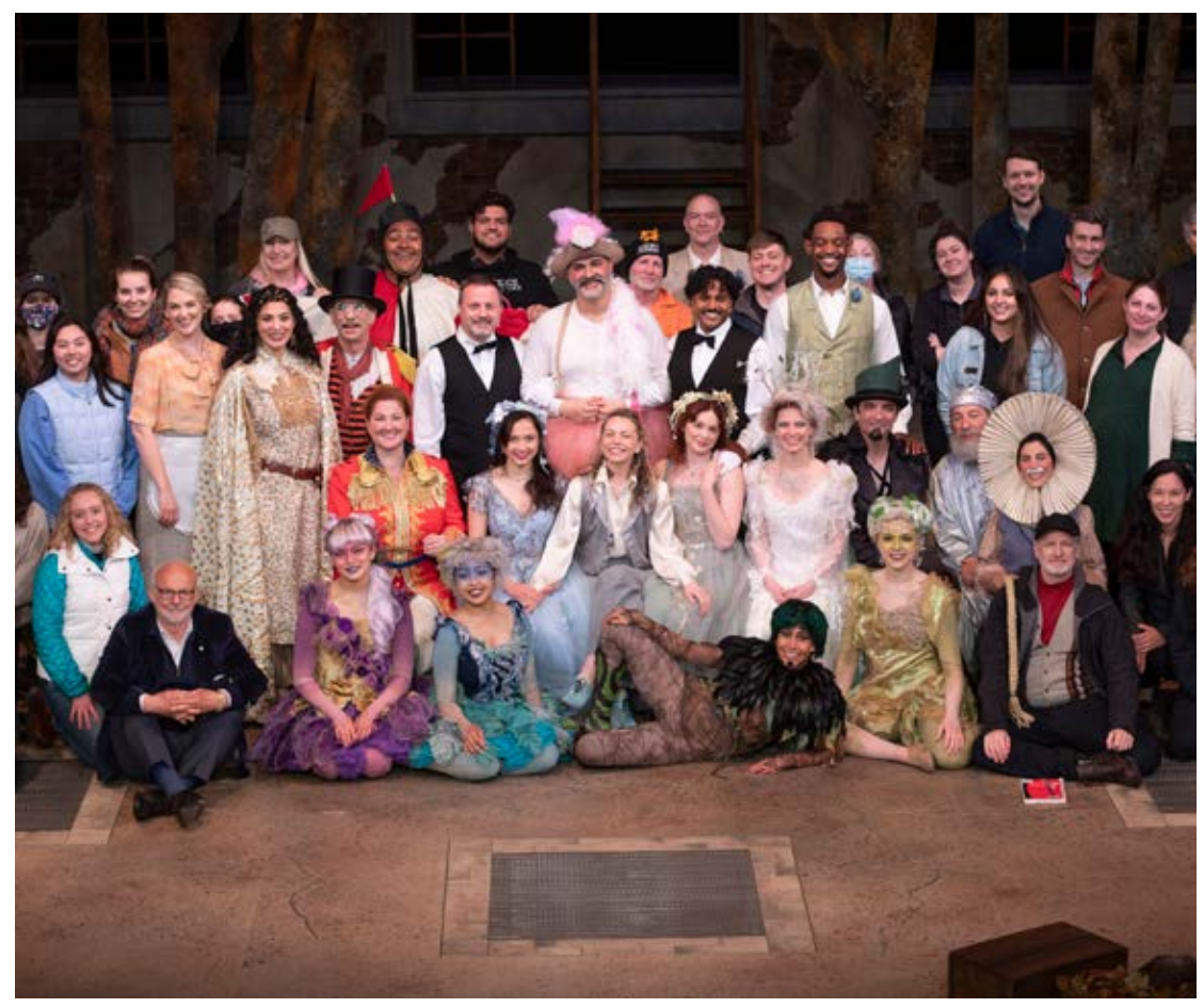
Cast and crew of Bard on the Beach's play A Midsummer Night's Dream

However, there were minor gaps and inconsistencies in the evaluation process and the design and implementation of the monitoring strategy. These exceptions did not significantly affect the ministry's compliance with policy and program guidance.