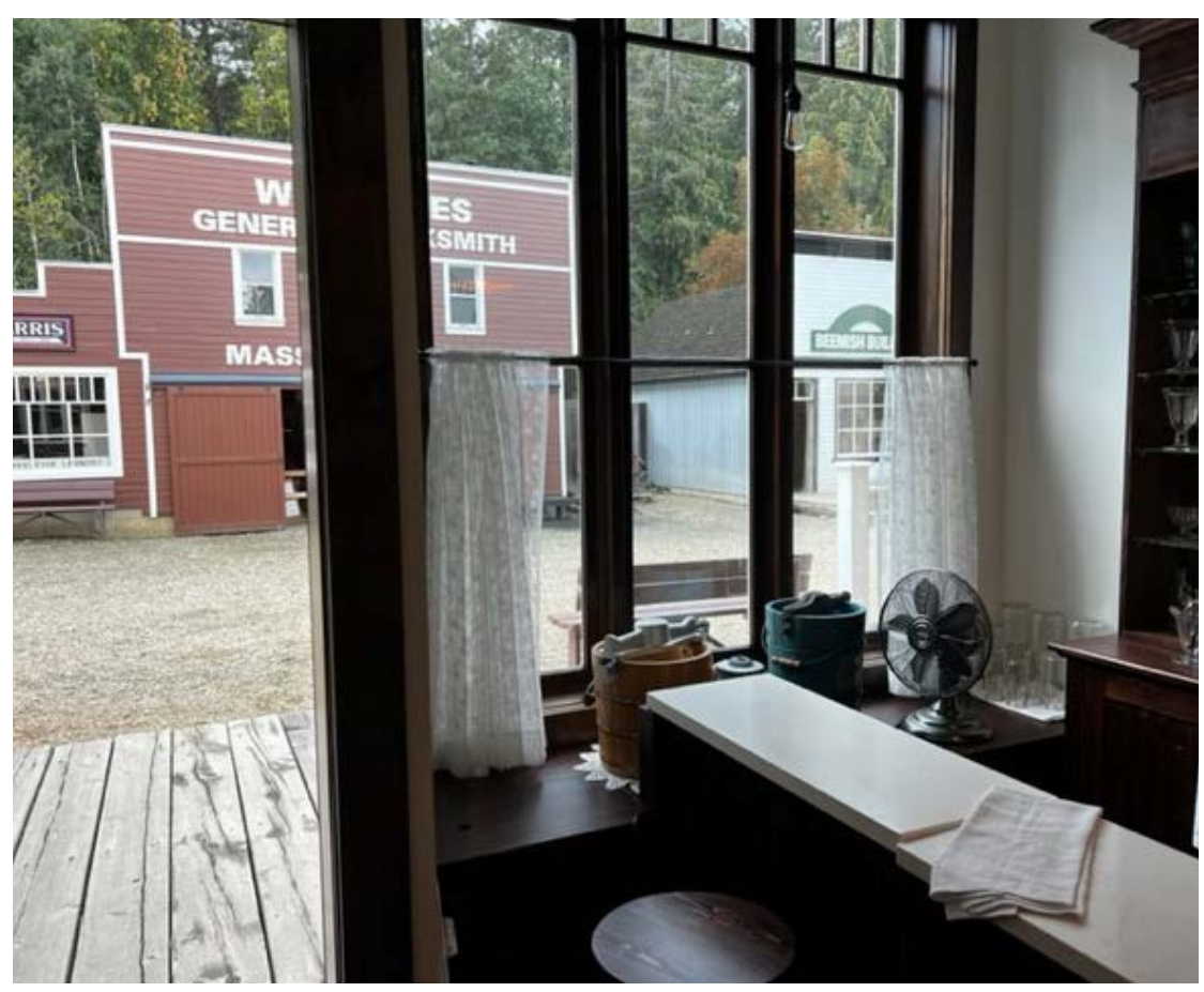
Shuswap cultural heritage attraction project