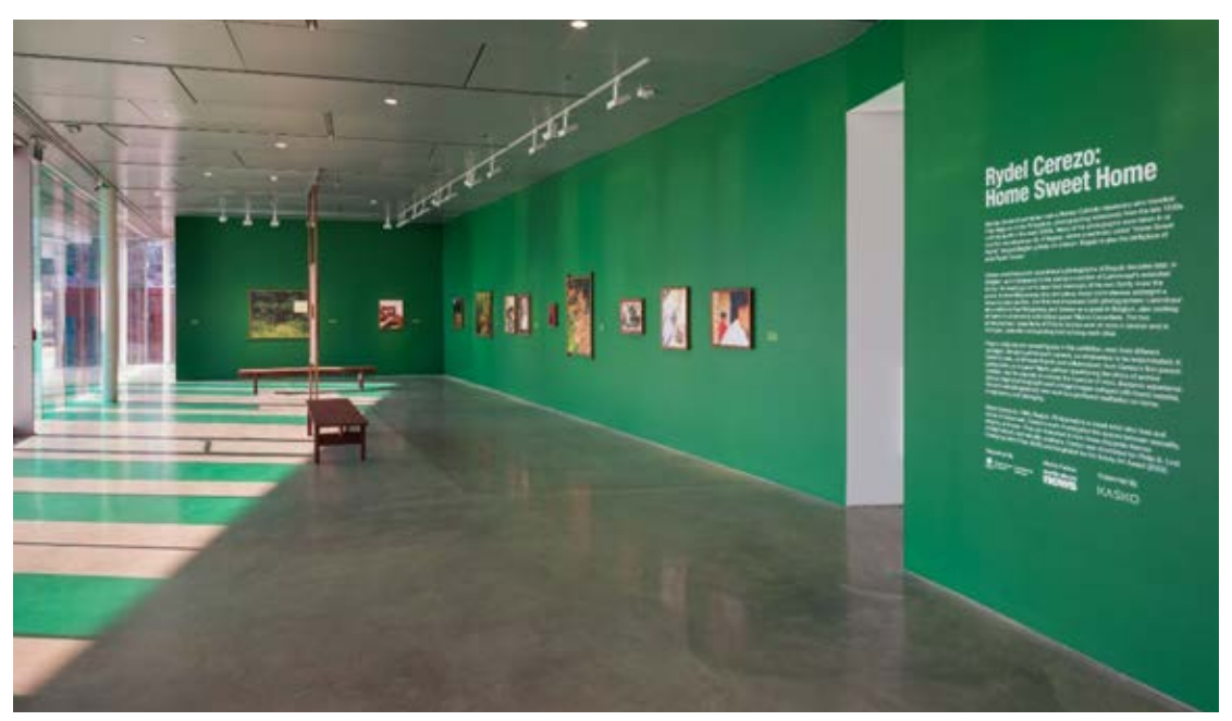
The Polygon Gallery, North Vancouver

Learn more about how we did this audit on page 22.