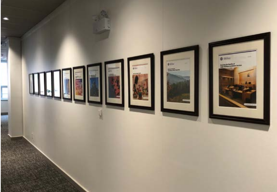
Framed covers of the office's recently released performance audit reports.