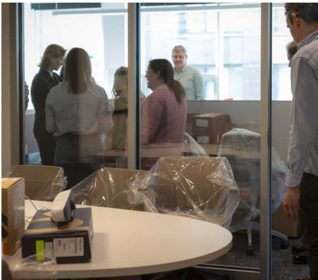
OAGBC staff during a walk-through to review the office's leading workplace strategies renovations.

Our IT infrastructure and services underwent extensive updates and improvements this year. We successfully moved to an off-site, professionally managed service environment. The more stable, secure network helps to improve the quality of our work. We also completed a partial review and optimization of business tools that streamlined operations and improved IT support.