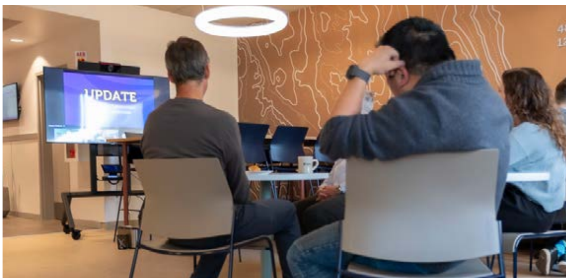
Members of OAGBC staff attend a combined in-house and virtual all-staff meeting.