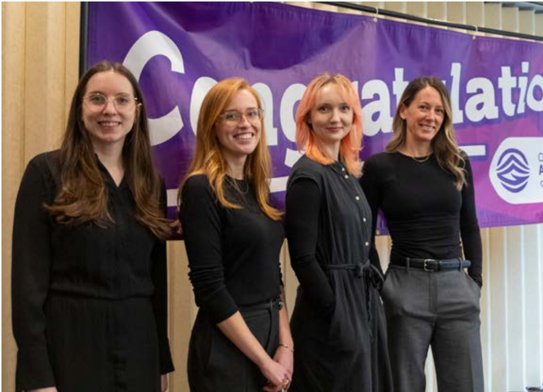
The audit team at the release of the office's performance audit report, Child Care Licencing Capacity.