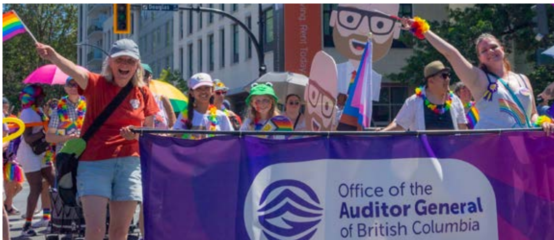
OAGBC staff and friends participating in Victoria's annual Pride Parade.

We are also pleased to employ post-secondary co-op students in our office, with three students joining the OAG team in 2025.