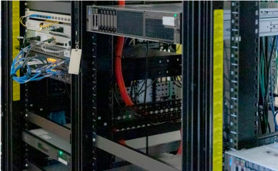
The office's empty in-house data centre server racks after the centre moved off-site in 2024.

By January 2025, the full migration of information systems and data was completed, culminating with the formal decommissioning of the old on-site data centre in March 2025. Under budget, the RAMP project delivered substantial cost savings, minimized risk exposure, and introduced significant operational efficiencies. This comprehensive transformation has positioned the organization for improved performance, scalability, and the long-term sustainability of its IT operations while establishing a new level of cybersecurity maturity.